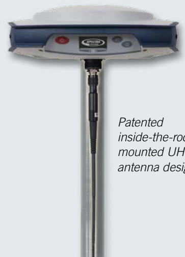
Patented inside-the-rod mounted UHF antenna design